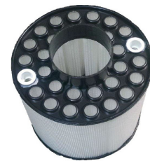
Underside of filter