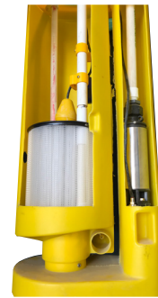
Filter in vault